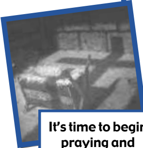
It's time to begin praying and preparing for His-Story 2008!