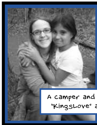
A camper and a counselor experiencing "KingsLove" at Spring Retreat 2008